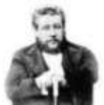
Charles H. Spurgeon

"I believe that one reason why the church of God at this present moment has so little influence over the world is because the world has so much influence over the church."